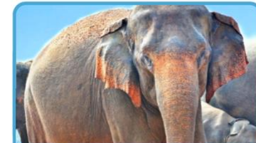
an Asian elephant