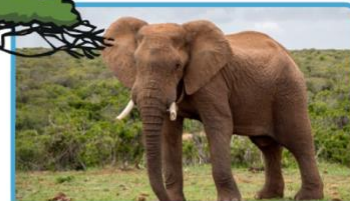
an African elephant

There are three simple ways to tell whether the elephant you are looking at is an African elephant or an Asian elephant. You can look at their ears, the shape of their head and their tusks.